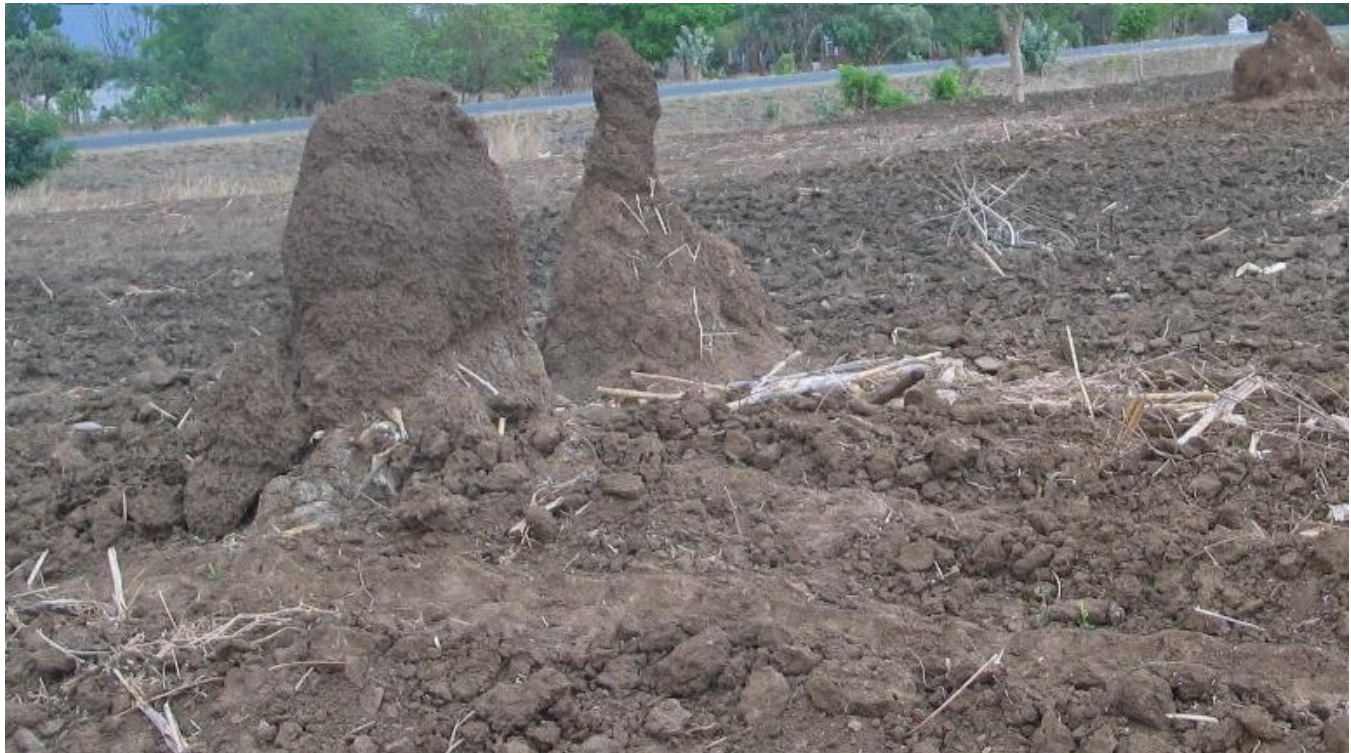
Fig. 3. Farmers' usually leave termitaria intact when cultivating crop fields. This figure shows live Macrotermes mounds left in a field ready for planting maize in Balaka district of southern Malawi.

Sileshi et al. 2005). In Uganda, termite attack was lower in maize–soybean ( Glycine max ) than in maize–groundnut or maize–bean intercrops (Sekamatte et al. 2003). Similarly, in Zambia, some legume trees in agroforestry reduced termite damage to maize more than others (Sileshi et al. 2005). These differences could be attributed to variations in leaf litter, which serves as an alternative source of food for termites and the thick canopy in the intercrops that encouraged predation (Sekamatte et al. 2003, Sileshi et al. 2005).