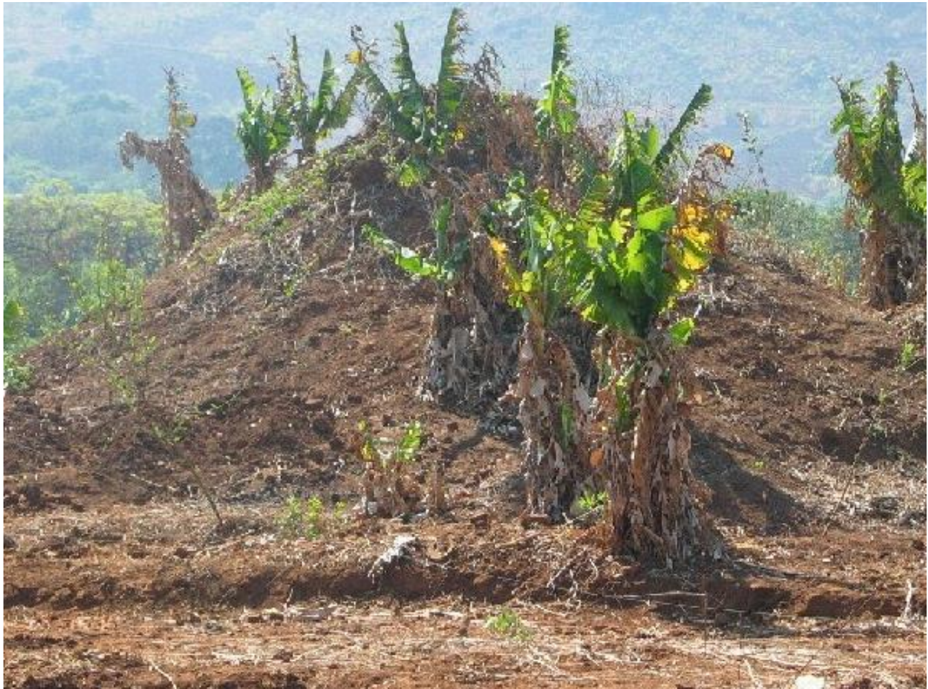
Fig. 2. Farmers' practice of planting crops around termitaria. This farmer in Zomba district of southern Malawi has planted banana and pigeon pea on an Odontotermes mound.