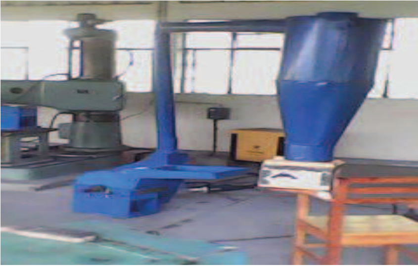
Figure 1: Completed Maize Mill by Students of Mechanical Engineering at Uganda Technical College, Bushenyi 2013