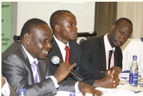
Cover Photo: Hon. Fred Omach (with microphone), the Minister for Finance (General Duties), Hon. Oduman Okello, Shadow Minister for Finance and Morrison Rwakakamba, UNCCI chief during the 10 th session of the State of the Nation Platform held at Protea Hotel on July 2, 2010

A national budget 1 is as good a place to start as any when one sets out to examine a country's development priorities. That is what happened at the 10 th State of the Nation Platform debate. The