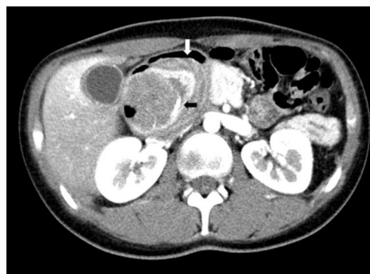
Fig. 2. Pre-operative Transverse contrast-enhanced Computer Tomography scan showing the stomach with a round mass (black arrow) protruding into the duodenum (white arrow) indicating gastroduodenal intussusception.

The patient underwent an exploratory laparotomy. Gastroduodenal intussusception with a 6x7cm, well-circumscribed ulcerated mass arising from the gastric body acting as a lead point was found. (Fig. 3) The intussusception was reduced manually and gastric wedge resection of the tumor was done. Stomach was repaired in 2 layers hand sewn