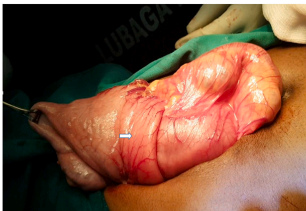
Fig. 3. Intraoperative photograph showing the stomach invaginating into the duodenum distally (white arrow).

carcinoma, gastric schwannoma and giant Brunner gland hamartoma [10–13]. GIST tumors are the most common cause of gastroduodenal intussusception. At 23 years, this patient is younger than the other previously reported cases of GISTs causing gastroduodenal intussusception (Mean age 64.5, median age 65 and range 29–95 years) [14,15].