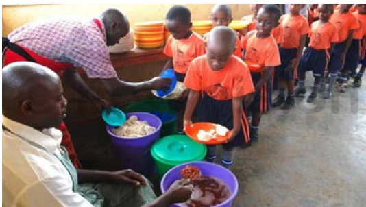
School Feeding: Photo courtesy of the New Vision