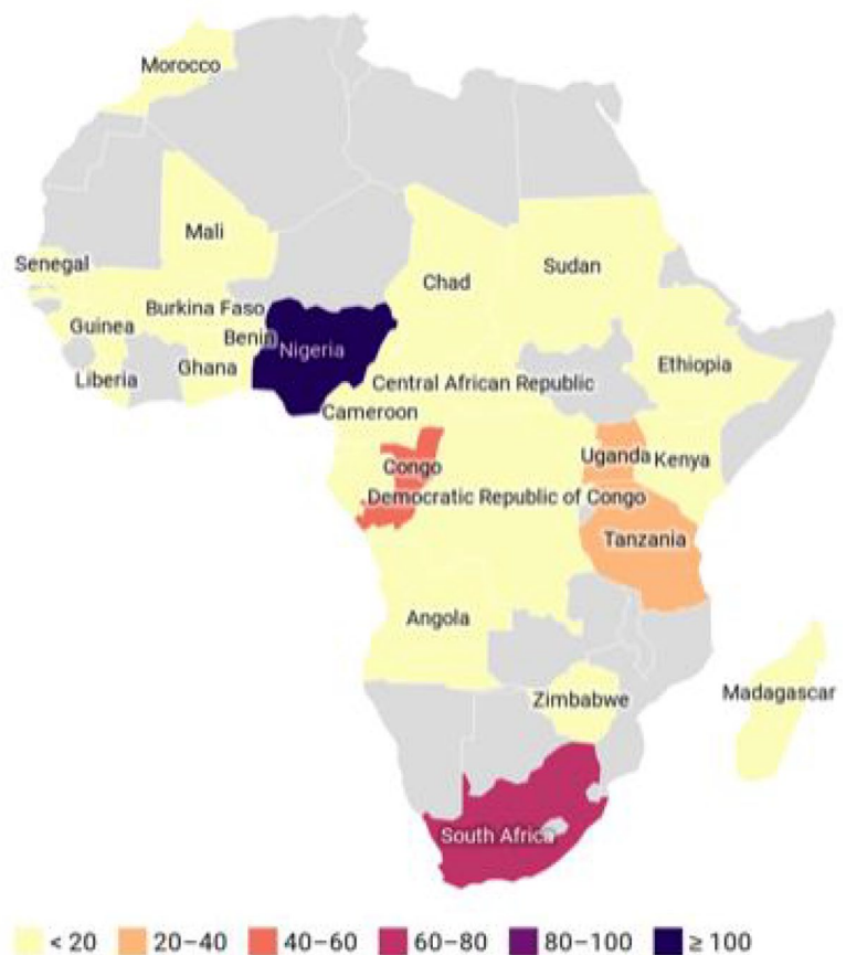
Figure 1. Published cases of histoplasmosis in Africa. 8,36

Progressive disseminated histoplasmosis usually occurs in the immunocompromised patients, especially in the HIV-positive population, due to failure of cell-mediated immunity. It is mostly seen in patients with a CD4 T-cell count of less than 150 cells per microliter. Although disseminated histoplasmosis can be reported in immunocompetent patients, it is an AIDS-defining infection, 32 with a high mortality and morbidity in HIV-positive patients. 33,34 Any body organ can be affected, but it is mostly seen in the lung, liver, spleen, brain and adrenals. 35 A review on histoplasmosis in Africa by Oladele et al. showed 470 cases of histoplasmosis reported in Africa over the last six decades, with HIV-infected patients accounting for 38% (178) of the cases 8 (Figure 1).