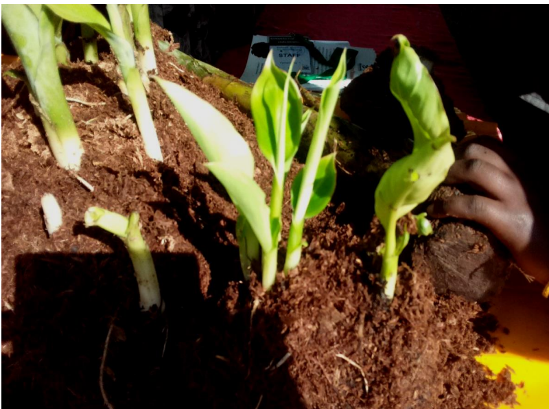
Figure 4: Macropropagation of bananas by planting whole corms in moist nursery substrate.

bud, individual buds along with some corm material are removed from large corms (forming so-called mini-sets) and planted individually (Faturoti et al. 2002). The corm of a harvested plant, also known as a bullhead, can be used for these methods and up to 150 suckers can be harvested per corm (Stover and Simmonds 1987; Tushemereirwe et al. 2001).