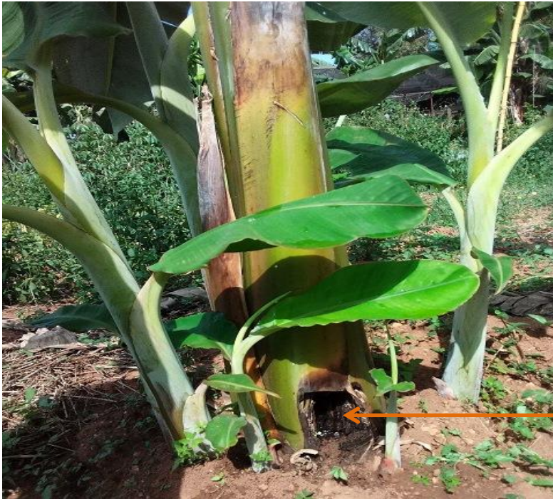
Figure 3: A decapitated banana plant with many suckers growing around it.