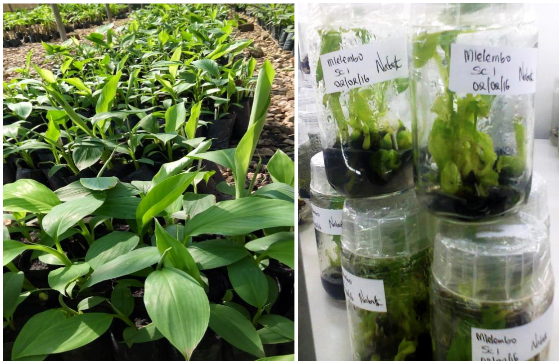
Figure 5: Banana plantlets generated through tissue culture.

Although tissue culture is a powerful plant propagation method, it demands high investments, specialized equipment and skilled personnel (George and Manuel 2013). As a result, these factors raise the unit cost of a tissue-cultured plant. To circumvent this, attention has been placed on modifying the composition of the growth media, to accommodate the wide range of varieties (Talengera et al. 1994; Arinaitwe et al. 1999) and lower production costs (Ogero et al. 2012; Watt 2012).