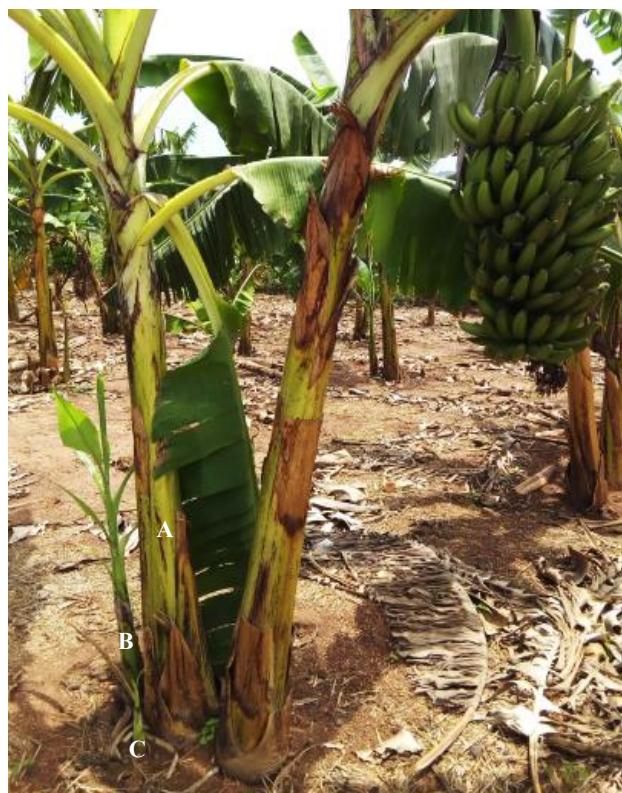
Figure 2: Different sucker types: A = maiden sucker, B = sword sucker, C = peeper sucker.

Decapitation: Suckering can be stimulated in banana mats by reducing the apical dominance posed by the mother plant. This is achieved by killing the growing point of the mother plant through a window made at the base of the pseudostem (Faturoti et al. 2002; Pillay et al. 2011). This method is also known as false decapitation, as the foliage of the mother plant remains physiologically active to feed the suckers (Figure 3). Complete decapitation involves stimulating suckering by cutting back the whole pseudostem of the mother plant. Modification of this method has been experimented by scoping out the