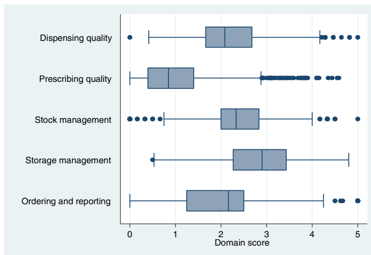
Fig. 2 Box and whisker diagram of baseline domain performance scores of 1384 public health facilities in Uganda, 2010–2013. The figure displays the distribution of scores in the five domains. Shown are the minimum scores excluding outliers (first whisker - 25 th percentile - 1.5*interquartile range [IQR]) and maximum score excluding outliers (last whisker - 75 th percentile + 1.5*IQR); the first quartile (lower part of the box), the median (line in box), and the third quartile (upper part of the box) and dots show the outlying scores. The spaces between the different parts of the box indicate the degree of dispersion (spread) and direction of skewness in the data for each of the five domains (on a scale of 0–5)

differed (10.4 among those with high capacity, 9.6 among those with medium capacity, and 10.4 among those with low capacity), corresponding to MM practices across facilities in districts with a different capacity levels ( p = 0.009 ).