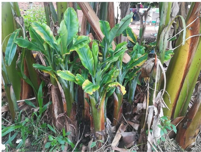
FIGURE 2 Banana plants (cv. Bluggoe, Musa ABB genome) with stunted leaves and yellow leaf margins and a bunched and choked appearance characteristic of banana bunchy top disease

southerly latitudes have prevented aphid-mediated spread of BBTD from infested regions in DR Congo into mid-altitude sites in western Uganda.