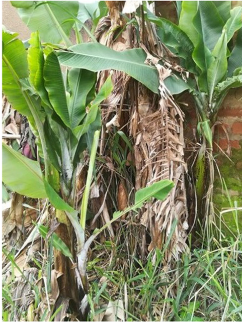
FIGURE 1 Banana plants (cv. Dwarf Cavendish, Musa AAA genome) with stunted leaves and yellow leaf margins and a bunched and choked appearance characteristic of banana bunchy top disease