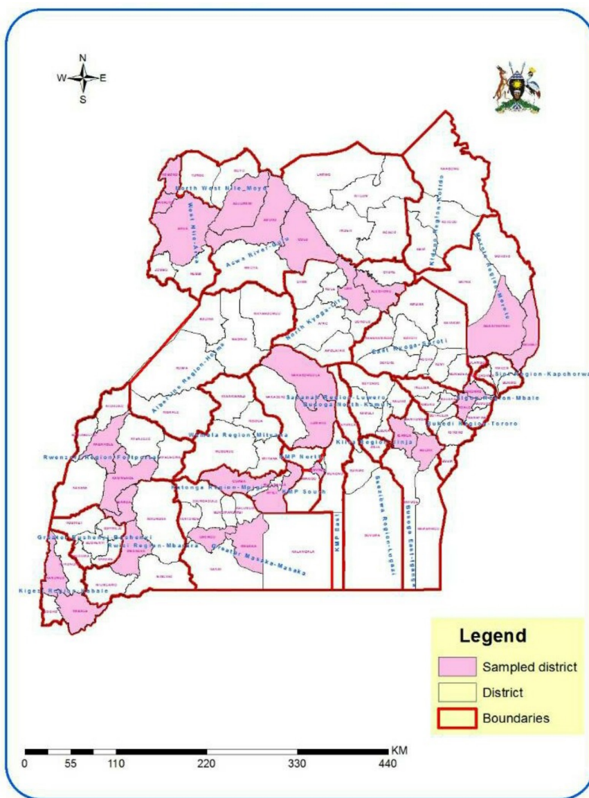
Figure 2 Map of Uganda highlighting districts included in the study.

From each of the 16 selected regions, two districts were sampled as follows: the district with the highest crash burden in the region (as reported by the police) and one other district, randomly selected from the remaining pool in the region; these were deemed 'low burden' relative to the district with the highest burden. From each district, the highest-level health facility (regional referral hospital, a general hospital or a health centre IV), one mortuary (where available) and the main police station were selected (The Uganda health system is organised as follows: national referral hospitals, regional referral hospitals, general hospitals, health centres IV, III, II, and I, IV being the largest.) (figures 1 and 2). There is typically one general hospital per district in Uganda and a regional referral hospital that serves several geographically adjacent districts. Where a regional