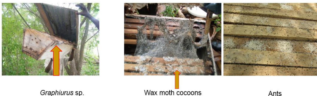
Fig. 1. Pictures of selected honeybee pests (rats, wax moths and ants) observed during the study