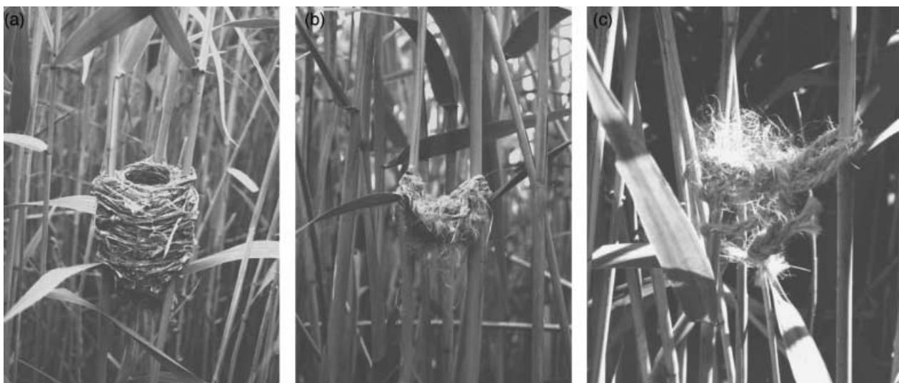
Figure 1. Type I nest (a) and type II nest (b) of an Australian Reed Warbler, and artificial type II nest (c) used in the nest-addition experiment.