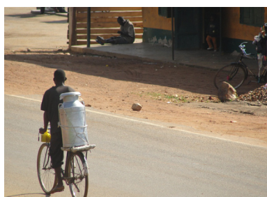
Picture No3: Informal Raw Milk Outlets Delivering Relatively Cheaper Milk to Low income group Consumers