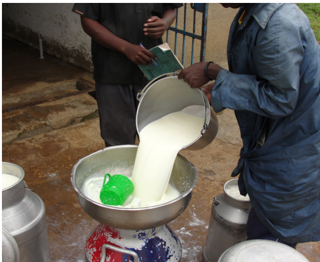
Picture No1: Increasing Marketable milk surpluses from Dairying Households in Uganda

The analysis of the 2009 Uganda National panel Survey (UNPS) collected by the UBoS shows that milk production from small-holder farm units was 1 billion litres, and about 52 percent (524 million litres) joined the second level of the milk value chain – and of which 72 percent was marketed in unprocessed form to consumers. High informality in milk marketing can be reduced by supporting strong primary dairy farmers' cooperative societies with capacity to invest in processing of scale neutral dairy products (yoghurts, ghee and cheese), at the same time hold strong bargaining power with large milk processing companies. This would allow the deeper participation of farmers (as groups) in the down-stream milk value chain, and enable having the right price incentives to draw more raw milk into the formal stream of the milk value chain. This would foster equitable spread of benefits and opportunities from the growing domestic demand for milk and other dairy products at all levels of the milk value chain.