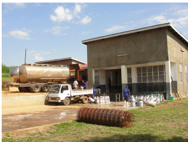
Picture No2: Well-equipped milk collection centre for Processing (formal) in South Western Uganda