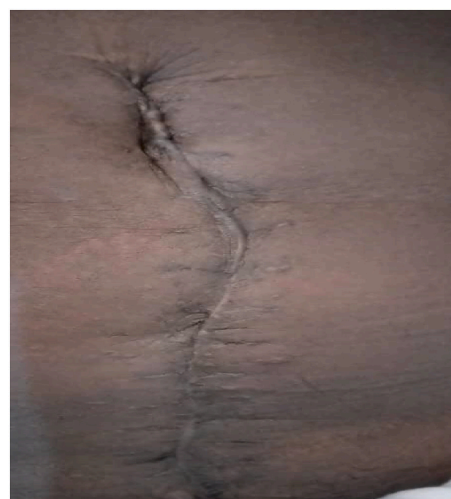
Fig. 4. Photography of the scar 3 months post-surgery.

proposed as an explanation of the condition's pathophysiology [12]. It is thought that during a cesarean delivery endometrial tissue is inoculated into the incision. With an appropriate supply of nutrients and hormonal stimuli, these endometrial cells survive and proliferate if there are sufficient nutrients and the appropriate hormonal environment [7].