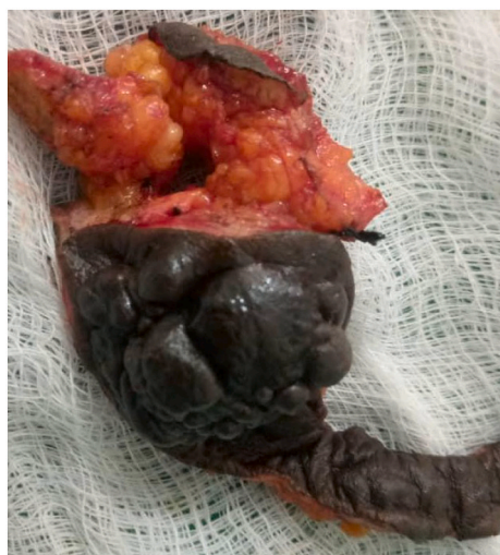
Fig. 2. Photography of intra-operative findings showing the cesarian section scar's mass after full resection.

procedures, such as hysterectomies, cystectomies, tubal ligations, amniocentesis [8], episiotomy [9], appendectomies, umbilical hernioplasty, and laparoscopic trocar tracts [10–11].