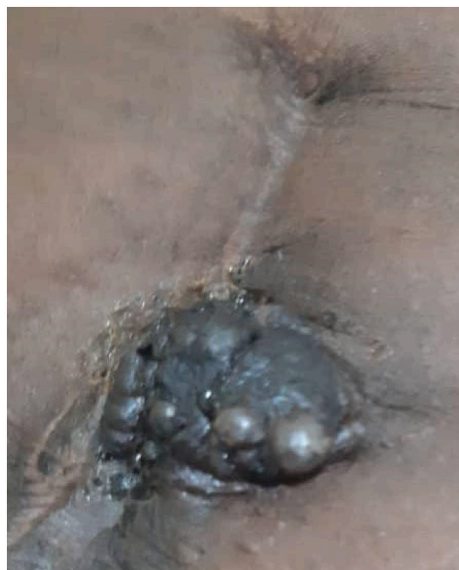
Fig. 1. Photography of the cesarian section scar showing a bourgeoning mass.