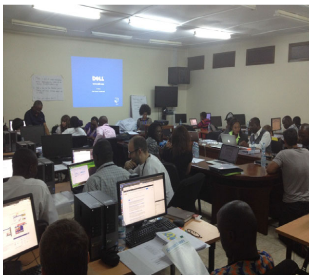
Figure 4 Bioinformatics training being conducted at the main site in Entebbe, 2013.

right from the start. This has helped establish us as an internationally recognised centre for research on HIV and other communicable diseases. The outcome of this process is a highly productive research Unit, influencing local and international policy and scientific thinking. The Unit has also played an important role in the capacity building for UVRI that includes training of staff, creating an academic environment including opportunities for short and long courses, seminars, supervision of staff and provision of laboratory space, among others (Figures 4 and 5). We have also supported the construction of a new clinic, training building, laboratories and other infrastructure. Over the years, we have created strong collaborations