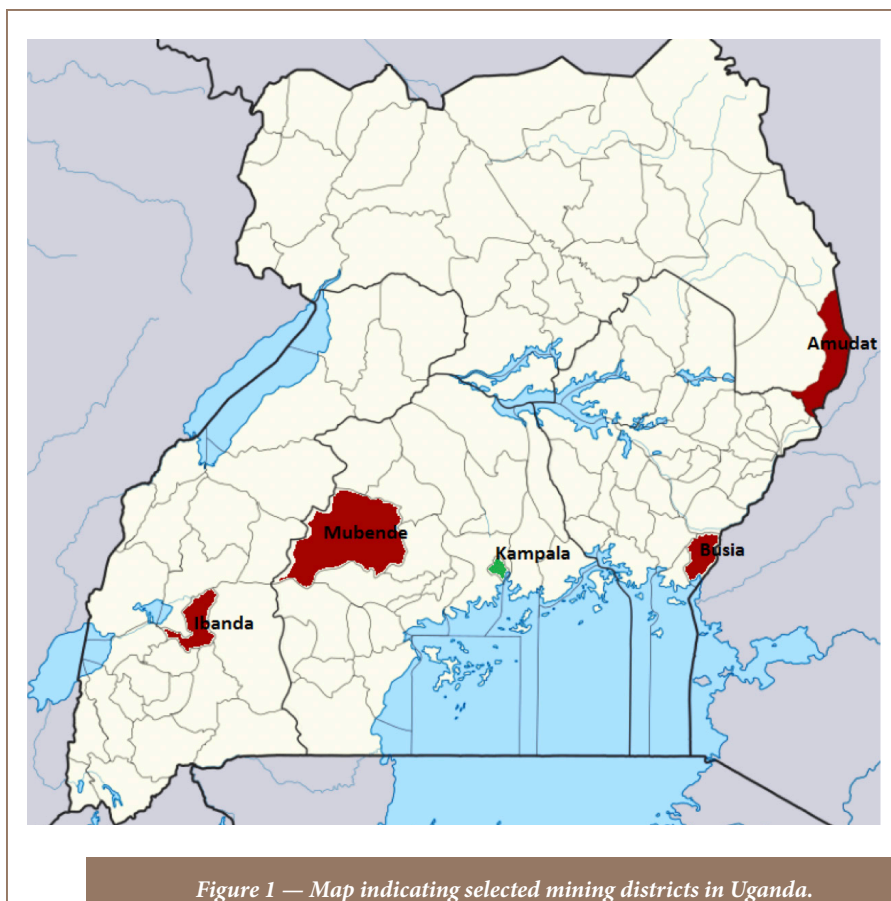
Figure 1 — Map indicating selected mining districts in Uganda. Adapted from the Uganda Population and Housing Census 2014 20

use of the World Health Organization (WHO) standardized questionnaire for assessing Hg exposure, health assessment, human bio-monitoring and ecological monitoring. 16