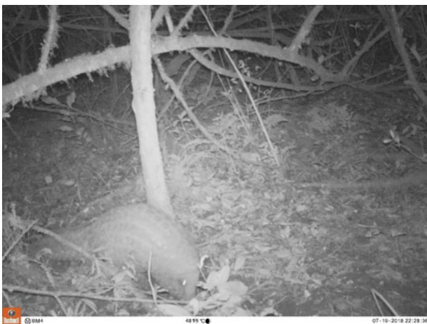
PLATE 1 Giant pangolin Smutsia gigantea photo-trapped in an Afromontane forest in western Kenya, on 19 July 2018 at 22.28.

a camera-trap survey conducted in July 2018 in a primary highland forest in Kenya’s Rift Valley region, in which a giant pangolin was captured in a single event (Plate 1). The presence of the giant pangolin in this location potentially makes it sympatric with Temminck’s pangolin, a species with which the giant pangolin can be confused because of their morphological similarities (Hoffmann et al., 2020). Although the area where the image was captured is within the defined range of Temminck’s pangolin (Pietersen et al., 2019), to our knowledge there are no confirmed records of Temminck’s pangolin from this area nor from rainforest habitats anywhere across its range. Confirmation of this record being a giant pangolin is based upon the habitat type and several physical characteristics: Temminck’s pangolin is considerably smaller than the giant pangolin (up to 140 cm in total length and weighs up to 21 kg; Pietersen et al., 2019), and a blue duiker Philantomba monticola