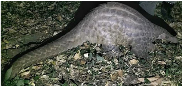
PLATE 2 Giant pangolin photographed by the side of the road on the edge of the savannah–Afromontane belt in western Kenya, in July 2018.

captured in the same position on the same camera (head and body length 55–90 cm and shoulder height 32–41 cm; Kingdon et al., 2013) provided a size reference. The pangolin recorded here is estimated to be at least 140 cm in length, with the girth, tail length, elongated head and body shape indicative of a giant pangolin. The front legs are relatively long and robust, suggesting the quadrupedal locomotion characteristic of the giant pangolin rather than the bipedal locomotion of Temminck’s pangolin, and the scale shape and rows are more consistent with those of the giant pangolin, having a greater number of more rounded scales relative to overall size (Hoffmann et al., 2020).