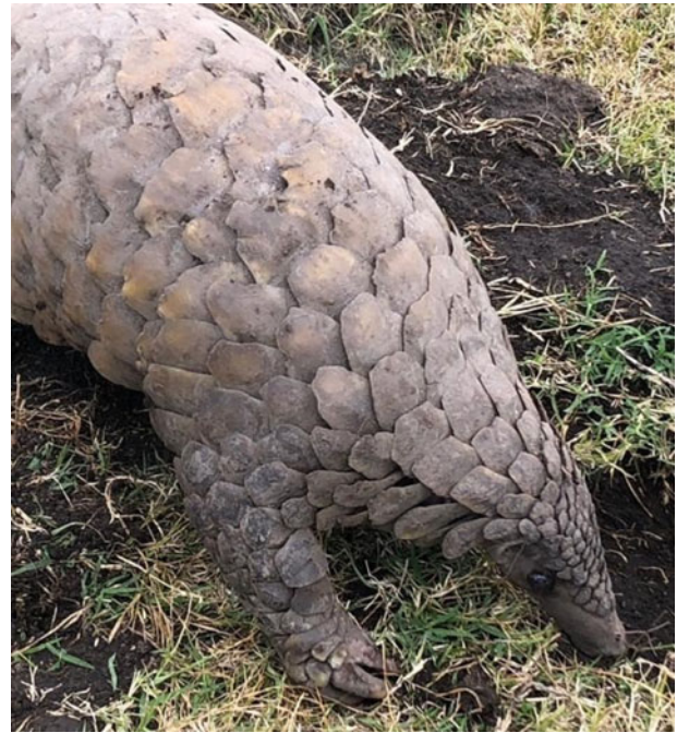
PLATE 3 Giant pangolin photographed during release after becoming trapped under an electrified fence. Photo was taken on the edge of the savannah–Afromontane belt in western Kenya, in August 2018.

A third record was reported in August 2018, c. 4 km west of the second sighting. A pangolin that had become trapped under an electrified fence was removed and relocated to a nearby forest. Videos and photographs were used to identify the animal based on its size, relative tail length, forelimb definition and movement suggesting the animal to be