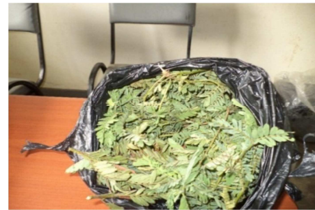
Figure 1. Fresh leaf sample of Cassia nigricans .