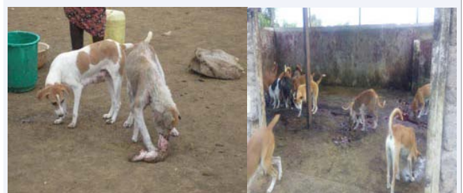
Figure 4 Unfenced slaughter slab, accessed by dogs, and dogs feed infected organs.

One of the informant indeed revealed that, instituting strict rules and regulations could only change some cultural norms within the community. He added, any attempt to condemn and properly dispose off the infected organs is considered wasteful. "When you condemn, they get so agitated, they think it is malicious intent, some are so aggressive that they threaten to shoot, even when you throw the condemn organs in a pit, or burry, they will still go and get it out and eat". One key informant added that most community members even don't fear that it's risky to eat dead animals. He further reported that his community members are so adamant that they don't understand that it is dangerous to eat a dead animal, even when the animal has died two days ago, they will celebrate and still eat it.