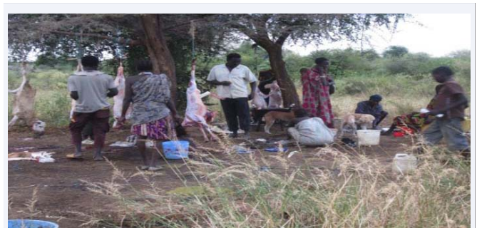
Figure 3 Illegal home/under the tree slaughter of animals in presence of dogs with no meat inspection.