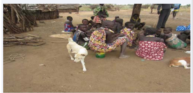
Figure 2 Close association between humans and dogs at household.