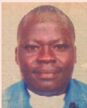
George Okello Candiya Bongomin

Abstract: The paper examined the mediating role of social networks in the relationship between financial intermediation and financial inclusion of poor households in rural Uganda. The paper used SPSS (statistical package for social scientist) and applied MedGraph program (Excel version 13), Sobel test, and Kenny & Baron guideline to test for the mediating role of social networks in the relationship between financial intermediation and financial inclusion. Quantitative data were collected from a total sample of 400 poor households living in rural Uganda who were randomly selected for this study. The findings revealed that social networks partially mediate in the relationship between financial intermediation and financial inclusion of poor households in rural Uganda. Besides, social networks and financial intermediation have significant and positive impacts on financial inclusion of poor households in rural Uganda. This implies that some effects of financial intermediation on financial inclusion go through social networks to cause an impact on financial inclusion of poor households