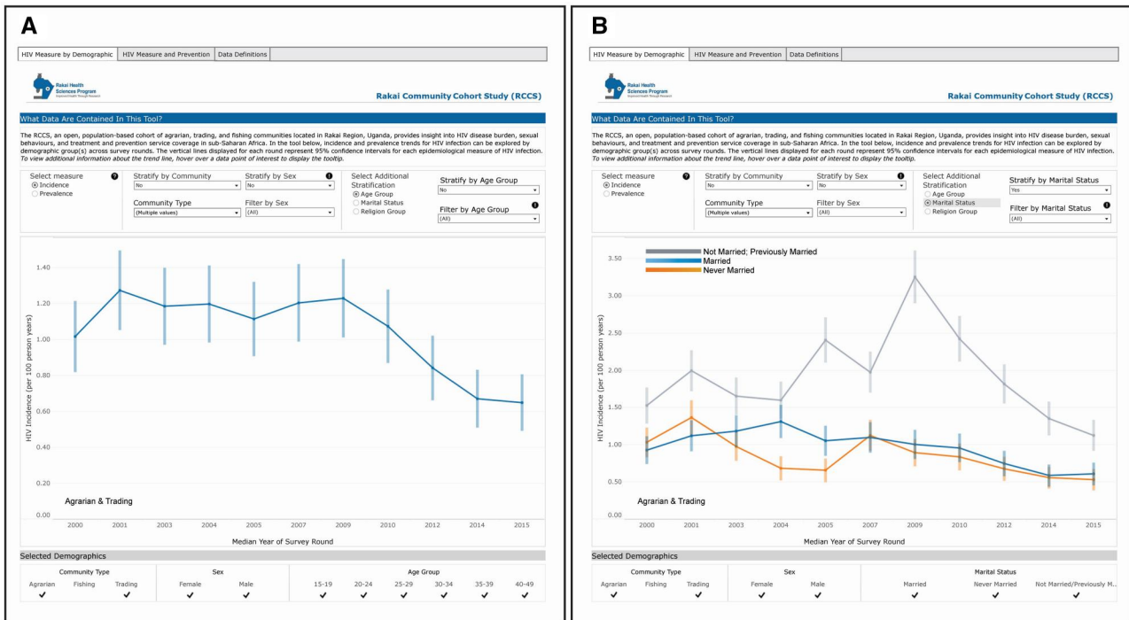
Figure 3. Case study #1: HIV incidence trends in agrarian and trading communities stratified by marital status. Using the “HIV Measure by Demographic” tab of the dashboard, users can view overall HIV incidence among the agrarian and trading communities (grouped) by selecting the following filters and stratifications: Select measure = “Incidence,” Stratify by Community = “No,” Community Type = “Agrarian” and “Trading,” Stratify by Sex = “No,” and Filter by Sex = “All” (A). To further stratify by marital status, users can update the right-hand side filters as follows: Select Additional Stratification = “Marital Status,” Stratify by Marital Status = “Yes,” and Filter by Marital Status = “All” (B). Singular data points represent the mean value for the specified year of survey round; vertical bars represent 95% confidence intervals.