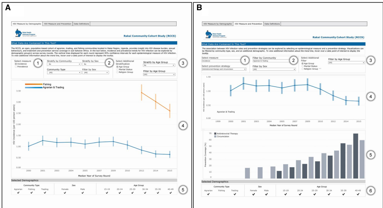
Figure 2. Dashboard design and overview. (A) Depicts the interactive features of the dashboard from the “HIV Measure by Demographic” tab, including: (1) HIV infection measure selector, (2) stratification and filtering actions by community, sex, and community type, (3) additional stratification and filtering based on age group, marital status, or religious group, (4) a line chart visualization of HIV infection trends by survey round in different community groups, and (5) selected demographics legend. (B) depicts the interactive features of the dashboard from the “HIV Measure and Prevention” tab, including: (1) HIV infection measure and prevention strategy selectors, (2) filtering actions by community and sex, (3) additional filtering based on age group, marital status, or religious group, (4) a line chart visualization of HIV infection trends by survey round, (5) a bar chart visualization of prevention coverage percentages stratified by intervention strategy and survey round, and (6) selected demographics legend. Singular data points represent the mean value for the specified year of survey round; vertical bars represent 95% confidence intervals.

demographics using the “Stratify by” drop-down selections along the top of the dashboard. These actions enable a user to visualize a trend line by community, sex, age group, marital status, and religion group. For example, the HIV incidence trend line for the “Agrarian & Trading” community group can be further stratified to display agrarian and trading communities separately by selecting “Yes” in the “Stratify by Community” drop-down filter. An additional tab in the dashboard, labeled “HIV Measure and Prevention,” allows users to view HIV incidence and prevalence trends together with ART and male circumcision coverage rates across population groups, as shown in Figure 2B.