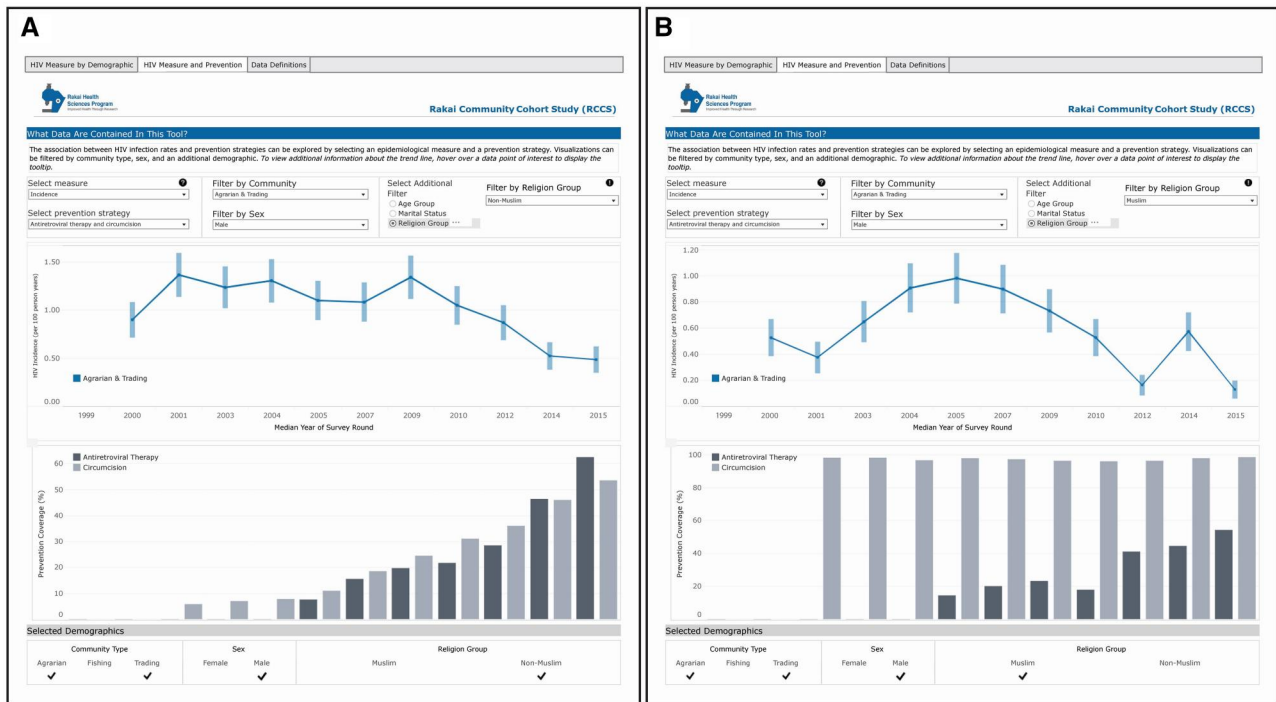
Figure 4. Case study #2: HIV incidence and prevention strategy trends among men in agrarian and trading communities stratified by religious group. Using the “HIV Measure and Prevention” tab of the dashboard, users can view HIV incidence and corresponding temporally aligned ART and circumcision coverage percentages among non-Muslim men in agrarian and trading communities (grouped) by selecting the following filters and stratifications: Select measure = “Incidence,” Select prevention strategy = “Antiretroviral therapy and circumcision,” Filter by Community = “Agrarian & Trading,” Filter by Sex = “Male,” Select Additional Filter = “Religion Group,” and Filter by Religion Group = “Non-Muslim” (A). To view these trends among Muslim men in the same communities, users can change the Filter by Religion Group to “Muslim” (B). The top graph displays HIV incidence (per 100 person years) by median year of survey round, while the bottom graph displays prevention strategy coverage percentages for the same years in those communities. Singular data points represent the mean value for the specified year of survey round; vertical bars represent 95% confidence intervals.