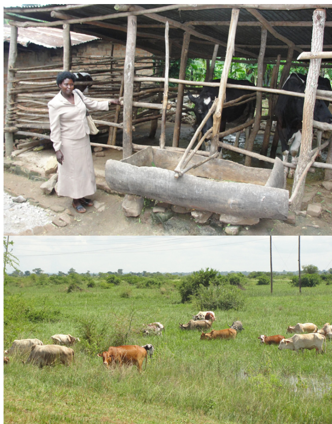
Picture No2: The dairy farming system ranges from zero and restricted grazing to extensive grazing of local Zebu in Eastern and Northern Uganda