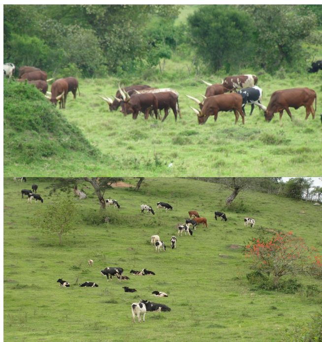
Picture No1: Changing Dairy Farming System from extensive grazing of Local Breeds to intensive rearing of fewer improved breeds in south Western Uganda

More technical support from dairy specialising NGOs like; Land O'Lakes, Heifer International and Send a Cow that provided the technical support to set off the dairy industry are still required to be rolled out country wide. This needs to be integrated with the public veterinary extension services in the various regions for sustainability. As more households enter the dairy business, knowledge gaps are apparent on the relatively new technologies encountered. Likewise the husbandry livestock farming systems are evolving from extensive with local breeds to semi-intensive - improved cross breeds systems in response to the reforms. These are pointers to new challenges that need to be addressed by the government to deliver a more vibrant dairy sector.