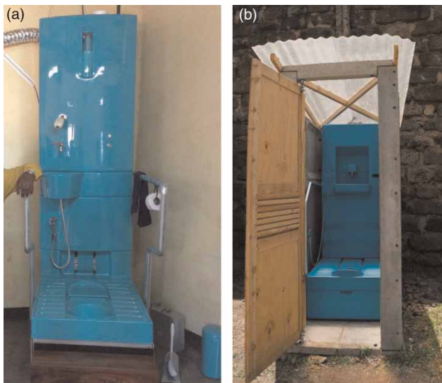
Figure 2 | Working models of the 'Blue Diversion' toilet: (a) the first working model tested in Uganda; (b) the second working model tested in Kenya. The second working model has been modified based on the results from the first pilot tests in Uganda (unpublished data). Primarily, this toilet is more compact (people found the first model too large), and foot pumps have been replaced by electrical pumps to make it easier to use for people with little physical strength, e.g. children and elderly people.

We found that safe water recovery through gravity-driven UF is feasible and maintenance-free operation is stable. Polishing by electrolysis makes the water more acceptable and increases the safety level. Energy consumption could be optimized to around 30 Wh/p/day, which are provided by a small solar panel on the roof connected to a battery built into the back of the toilet.