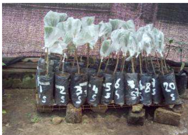
Fig. 3 Grafts placed on a wire mesh over bricks.

both the rootstock and scion were inserted with the tongues interlocking and matching the cambium layers. In the same way, the grafts were held firm with a polyethylene strip while ensuring that the scion did not slip during tying in.