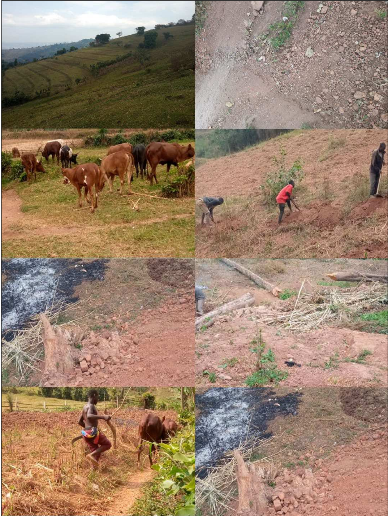
Figure 3: Some photos of land degradation in the in Kanungu District, Uganda.