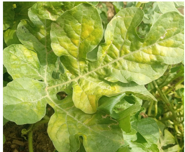
FIGURE 1 Yellowing symptoms of mature leaves on watermelon plant from Nakoosi, Mukono district, Central Uganda.

Three mature leaves of watermelon showing yellowing symptoms (Figure 1) were collected from a field in Mukono District in central Uganda. Samples were transported on ice to the National Crops Resources Research Institute, Namulonge, for total RNA extraction and RT-PCR amplification was done using primers designed targeting the coat protein region of the PABYV genome (forward 5'-GAATACGGTCGCGTTAGATCTAGC-3', reverse 5'-GTTCTGGACCTGGCACTGGATGG-3'). Fragments of the expected size (588 bp) were produced and sent to MacroGen Europe B.V (Amsterdam, The Netherlands) for direct sequencing.