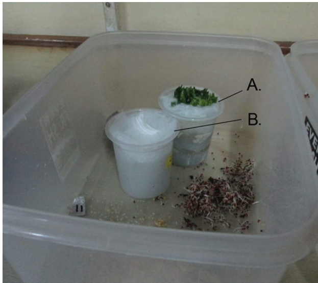
Fig. 1. The experimental unit in which egg-laying media were placed inside a transparent plastic jar with food for R. differens , (A) leaf sheaths of P. purpureum wrapped in polyester fiber, and (B) plastic cloth wrapped in polyester fiber (see online for color version).

the two egg-laying media (Fig. 1). Males were added to ensure fertilization of females. Moistened tissue paper was placed in each container as a source of water. There were 14 experimental units in the experiment. The individuals were fed ad libitum on a combination of freshly germinated millet, fresh maize, and sesame seed cake. The experiment was run for 2 wk and then the number of eggs laid was counted. The eggs were left to hatch in each medium