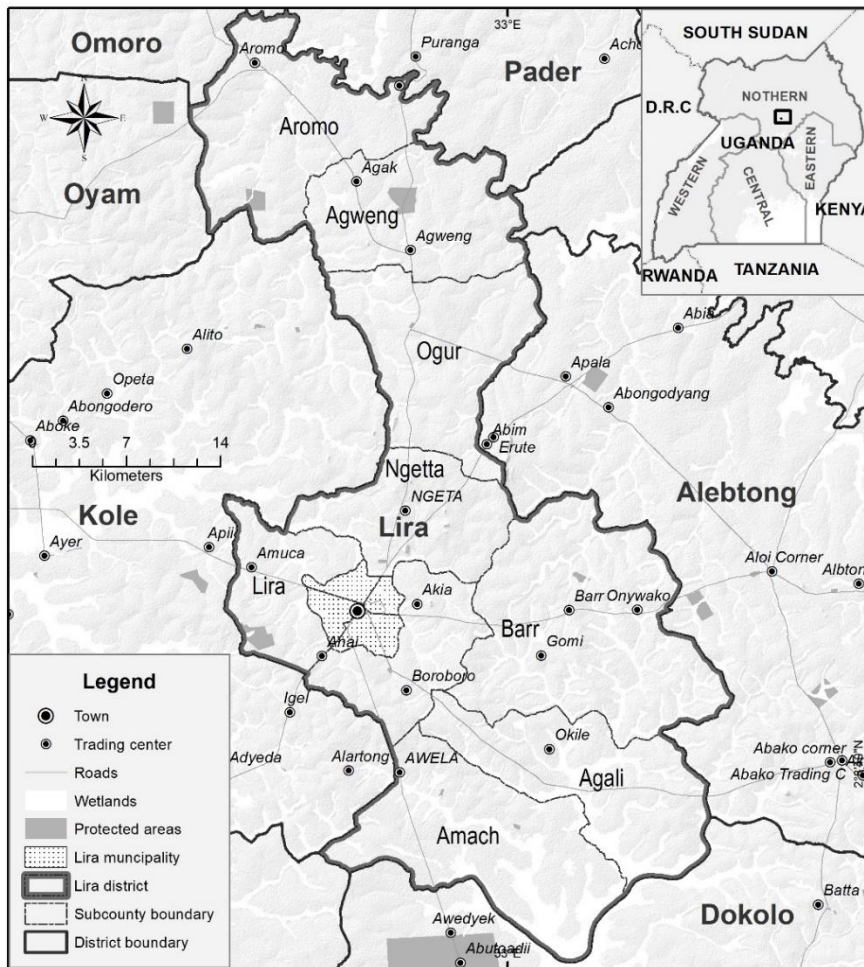
Figure 1: Map of Lira Municipality

Lira Municipality exhibits a uni-modal rainfall pattern with a single rainfall maximum. The rainy season stretches from March to November with a