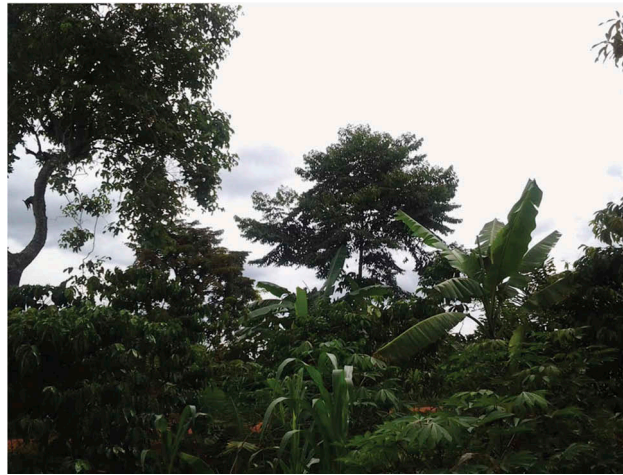
Figure 3. A homegarden maintained using agroforestry practices in one of the sugarcane cultivation villages of Jinja and Mayuge districts, eastern Uganda. The crops here included cassava ( Manihot esculenta ), maize ( Zea mays L), coffee ( Coffea sp.), bananas ( Musa spp.) and agroforestry trees (e.g. Maesopsis eminii ).

considered important and most cultivated in the homegardens. The area cultivated per household is small (approximately 0.4 ha/household) and continues to decline as much of the arable land is converted to monoculture sugarcane plantations. There was no significant association between the socio-economic factors (i.e. age of respondents, size of homegardens, sex of respondent and education status) and the crops grown in the homegardens ( p > 0.05 ) for all the pairwise comparisons. On the other hand, the frequency of mention of a plant as useful was significantly correlated (Pearson correlation = 0.829, p < 0.05 ) with its abundance in the area. This suggests that crops that were more abundant were highly likely to be reported as useful by many respondents.