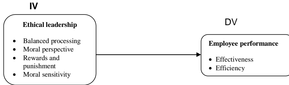
Figure 1. Theoretical model. Source: From the theory of ethical leadership (Brown et al., 2005) modified from literature review.

deeper than simply attaching a pleasant tone to an activity. Inasmuch as it is not inhibitory in its effects but is positively reinforcing, the actual reward and punishment permits more freedom of actions and accountability by the individual employee. Therefore, out of these supportive arguments the following hypothesis is proposed.