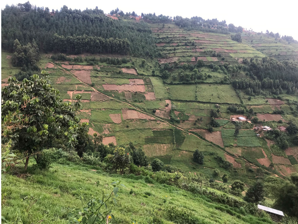
Fig. 3 Privately owned pine and eucalyptus woodlots in communities outside Bwindi Impenetrable National Park.

Households cited land scarcity and cost as a primary barrier to meeting wood product needs. Households varied in their ability to meet household wood needs, ranging from 45 to 90% of households across villages.