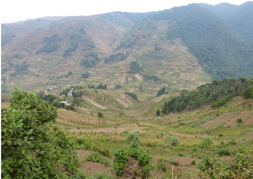
Fig. 1 Steep landscape with forest boundary, woodlots, and farmland outside Bwindi Impenetrable National Park, Uganda.

collective action (Katarwa 1999). Stretcher groups are traditional organizations that support access to healthcare and funeral services. Ugandan stretcher groups derive their name from the stretchers used to transport the ill from homes to hospitals and clinics or the deceased to be buried (Cunningham 2014). Due to the steep terrain and separation of villages by steep slopes and deep valleys, travel by foot or via motorbike was, and remains, the most practical means (Fig. 1). These groups emerged to take the sick or injured on a stretcher to the nearest healthcare facility to seek treatment. Stretcher groups continue to do so, serving their original purpose, and have expanded to operate as an organizational level below the official local council to adjudicate conflict, manage local resources, and maintain social networks (Katarwa 1999; Hamilton et al. 2000). The Ugandan context (i.e., forest-dependent communities, biodiversity hotspot, and stretcher groups as important local institutions) provides an opportunity to study the linkages between forest and woodlot management strategies and livelihood outcomes.