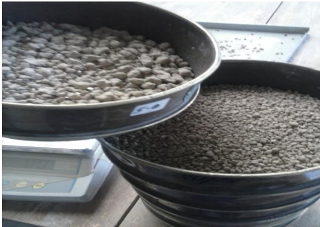
Fig 1. Sieve analysis for Aggregates Source (author 2013)

Experimental study design was employed. The main research method was laboratory research. Samples of concrete mixes containing varying amounts of Kunkur fines were made and subjected to the appropriate tests to determine the optimum amount. This is also Co relational research which aims to examine and describe the relationship between sand and Kunkur fines concrete using laboratory tests. Certain properties of Kunkur were also determined by laboratory tests as explained below. The study adopted the library, field and laboratory tests as the main forms of research.