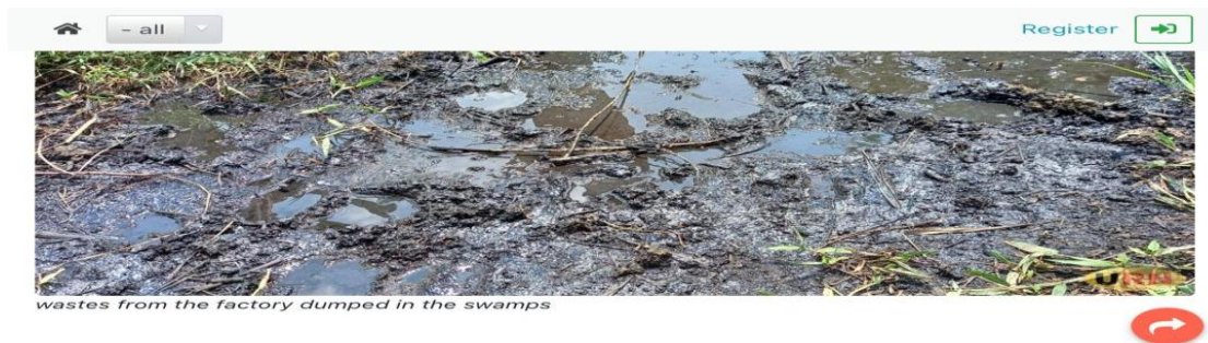
Fig. 4. Wastes from the factory dumped in the swamps

generated. Introducing SPs within the manufacturing domain will help to close the two gaps. The foregoing gaps drives us to the following research question, “what are the opportunities and challenges to the uptake of SPs among manufacturing firms in Uganda?” We focus on this thematic issue for four reasons. First, the study is timely because of the outbreak of Covid-19 pandemic, the president of Uganda called for manufacturing firms to increase the production of locally made products. In this study, we intended to create awareness within the manufacturing domain on the best practices that will help these firms to attain a balanced integration of environmental conservation, social as well as economic well-being. Second, there is sparse evidence of studies addressing this topic in Uganda. Third, for policy formulation, our study will guide regulatory bodies like NEMA in strengthening the environmental regulations geared towards driving the uptake of SPs in Uganda which is consistent with the third National Development Plan of 2020/21-2024/25, National Vision 2040 as well as the UN SDGs especially goal 12 (i.e. sustainable consumption and production). Lastly, to the management of the manufacturing firms. Management will be guided on the relevant decision criteria for selecting which practices are critical for their operations while at the same time introduce cleaner production mechanisms in the country.