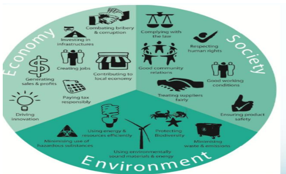
Fig. 3. The linkages between the environment, society and the economy Source: [35]