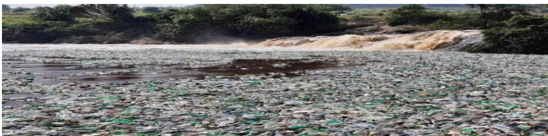
Fig. 5. Waste from the factories emitted in River Rwizi in the western part of Uganda