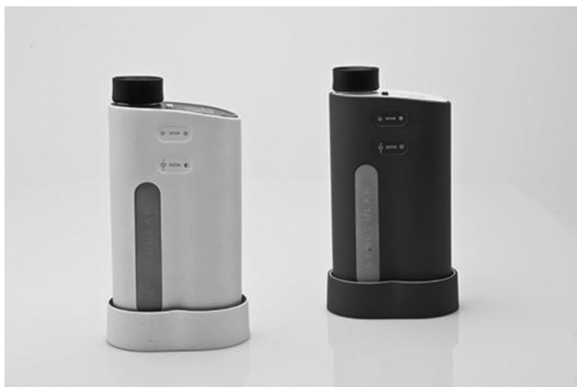
Figure 1. The Gynocular.

Statistical Analysis. Data were entered into MS Excel and exported to Stata version 11 (College Station, TX) for analysis. The baseline patient characteristics were summarized using means and frequencies (see Table 2). To test the level of agreement between the colposcopy and Gynocular, we calculated the percentage agreement