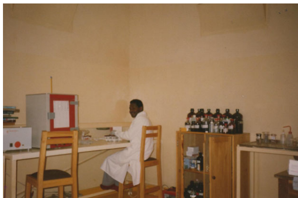
Figure 1 The laboratory at Kyamulibwa field station in 1990.