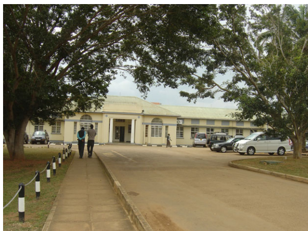
Figure 3 Uganda Virus Research Institute.

Uganda and globally and informed the future development of biomedical HIV interventions and health policy and practice. We have tackled all aspects of the epidemic from basic science through to public health policy. The achievements have been possible through partnerships established with many different individuals and organisations. We summarise some of these achievements in three periods.