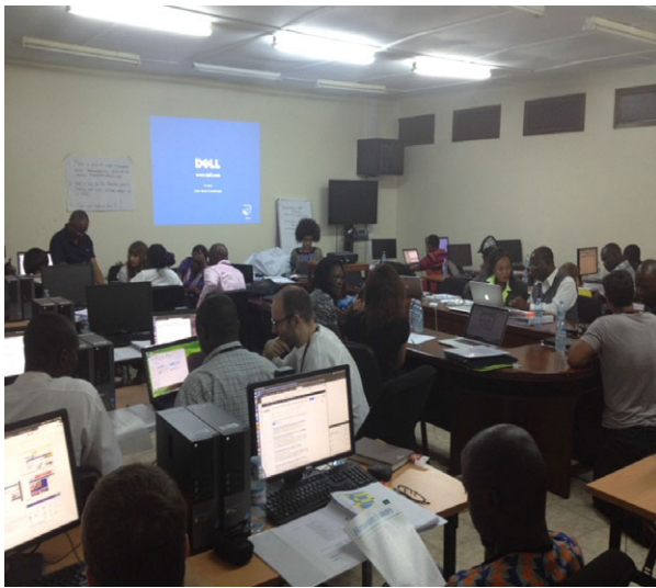
Figure 4 Bioinformatics training being conducted at the main site in Entebbe, 2013.

right from the start. This has helped establish us as an internationally recognised centre for research on HIV and other communicable diseases. The outcome of this process is a highly productive research Unit, influencing local and international policy and scientific thinking. The Unit has also played an important role in the capacity building for UVRI that includes training of staff, creating an academic environment including opportunities for short and long courses, seminars, supervision of staff and provision of laboratory space, among others (Figures 4 and 5). We have also supported the construction of a new clinic, training building, laboratories and other infrastructure. Over the years, we have created strong collaborations