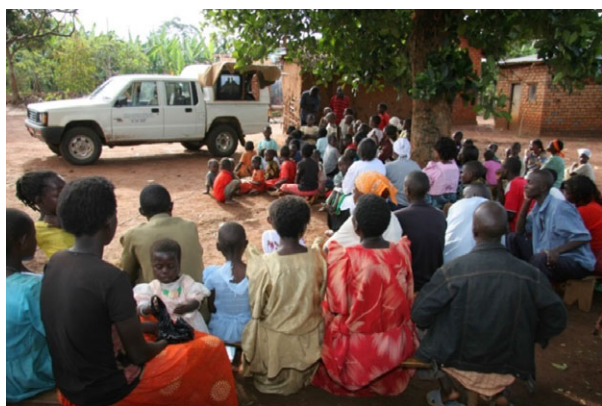
Figure 2 Community meeting in Kyamulibwa, Masaka District, 2009.