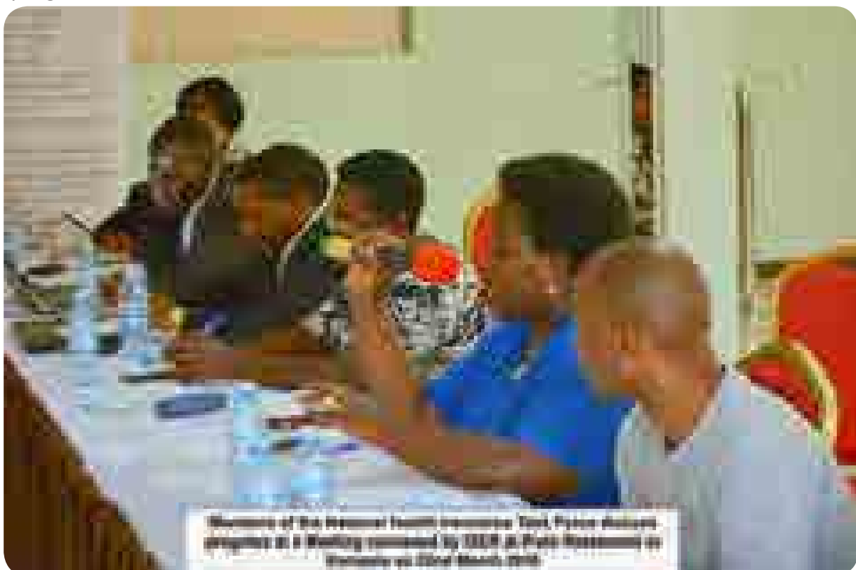
Members of the National Health Insurance Fund, Public Health, engaged in a meeting convened by UNFPA in Kampala on 12th May 2016.