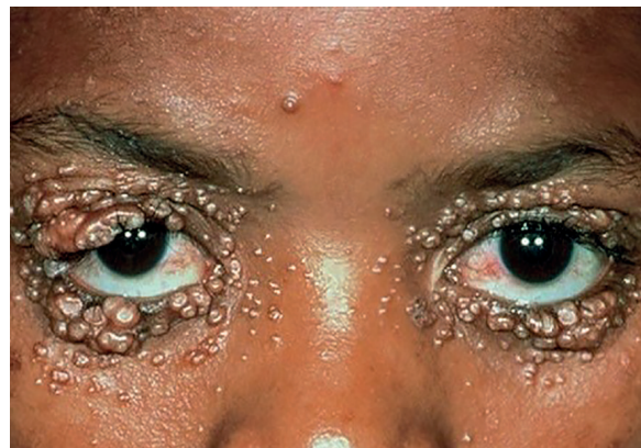
Figure 2 Molluscum contagiosum