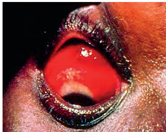
Figure 3 Kaposi's sarcoma