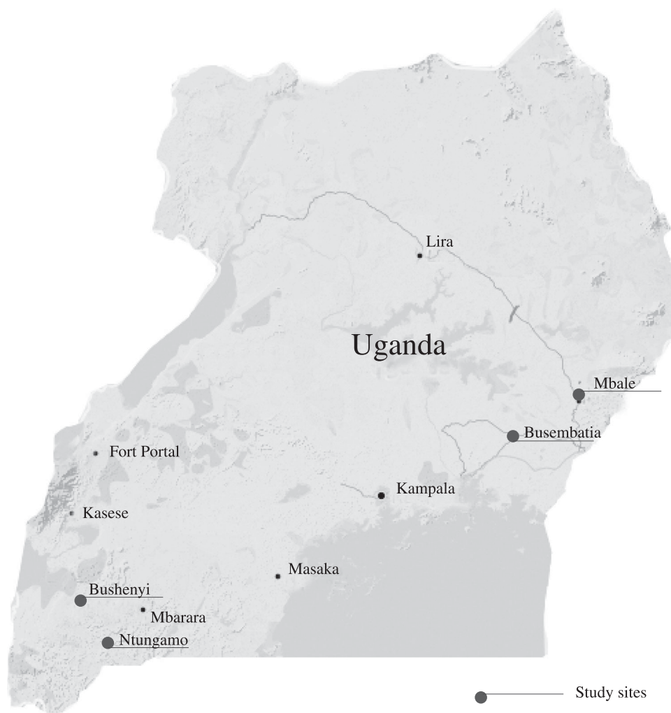
Figure 1. Study sites in Uganda (illustration based on Open Street Map data).

hierarchical clustering was selected for the k-means procedure. To show the difference between clusters regarding the three health domains, we used one-way ANOVA (not to be considered a validation of the clustering) to allow for more detailed interpretation. For measuring associations between categorical variables, we used chi-square tests and controlled family-wise error rates with the Bonferroni correction in case of multiple testing. To interpret significant associations, we calculated standardized residuals.