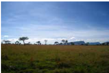
Fig. 3. Open Grassland at Nakicumet Napak District