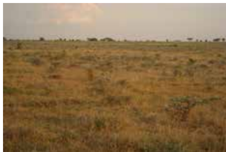
Fig. 4. Shrubs Mixed with Grasses in Lomejan Village in Kotido District

plots, nested plots were diagonally established from where the assessment was conducted. Five nested plots of 5 x 5 m were diagonally setup in the woodlands, ten plots of 5 x 5 m in the thicket and shrublands, and twenty plots of 1 x 1 m in the grasslands. Onsite identification of available grass and browse species was conducted in each of the plots. Grass and browse species that could not be readily identified were safely stored in a plant press and taken to Makerere University herbarium for further identification.