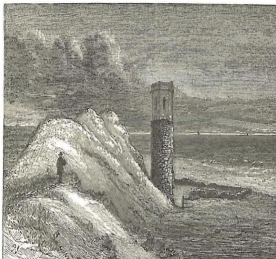
Figure 2; Eccles Tower after the storm of November 1862

In figure 1, the inland slope of the hills of blown sand is shown in this view, with Lighthouse of hasboroush, N.W. of the tower, in a distance. In figure 2 below