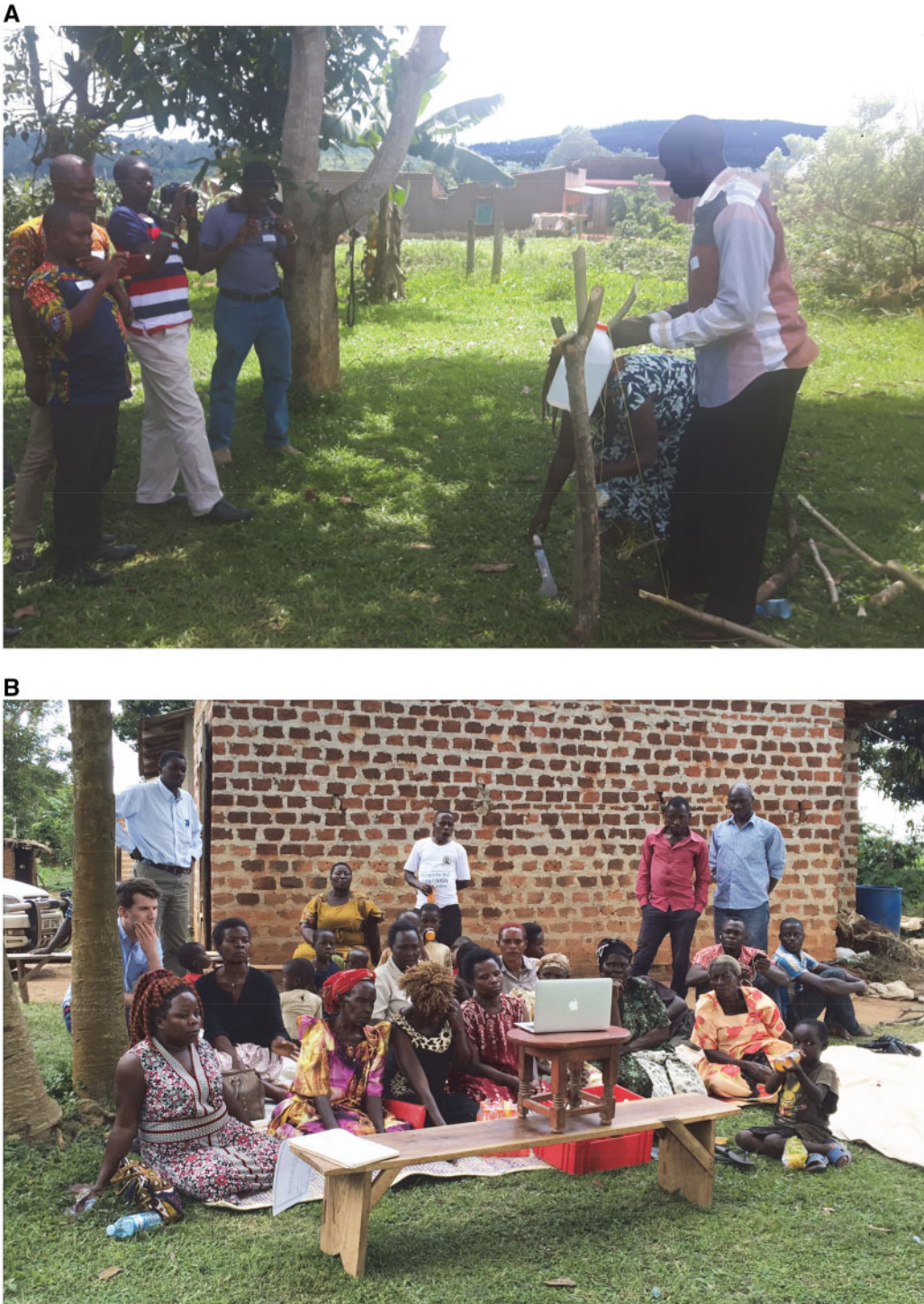
Fig. 2: Two Ugandan CHWs demonstrating how to construct a low-cost tippy-tap for hand washing (A). In the background Ugandan and Ghanaian CHWs can be seen videoing the demonstration. In (B) villagers watch the workshop video (05:39 min; Elimu Health 2018 ).