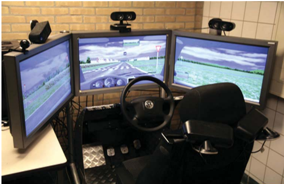
Figure 1: Vehicle learning simulator facility

Basbas et al. (2020) and Wanume et al. (2019) promote non-motorized measures to reduce RTAs. It is opined that such measures include roads designed to pull off pedestrian traffic and promote other non-motorized transport modes. Uganda Police Force uses express fines, instituting legal proceedings on drivers without permits have been alongside impromptu checkpoints. Route familiarity is argued to be one of the road safety measures. Dicke-Ogenia (2012) and Intini et al. (2020) and Harms (2010) opine that drivers who frequent the same may easily detect blind spots and changes on the road and avoid RTAs. Other initiatives have included providing simulator driving lessons to drivers of the future.