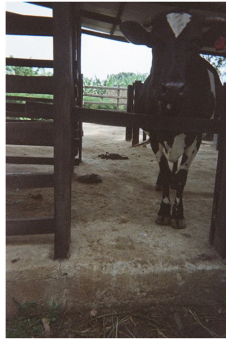
Fig. 4. Photo of a cow.

Children described the various psychological, emotional and social challenges that they experience. Experiencing anger was described frequently, and was related to being abused, bullied in school, being wrongly accused of a crime, and witnessing other children suffering. They also described feelings of distress related to remembering their past and present losses (such as the loss of parents), being abused by extended family and coping with their fears and challenges related to