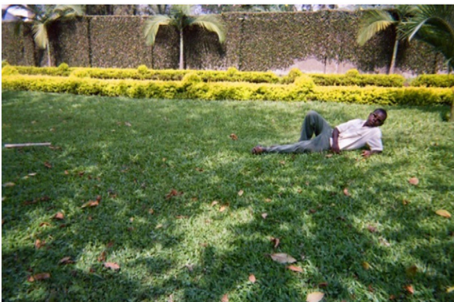
Fig. 3. Dreaming on the grass: After getting money, I will build a house.

Almost all of the children's photos and discussions depicted their hopes and dreams. When discussing their photos they described their desire to be successful, contributing members of society. One child described that they "have to work hard to achieve something". Another child described their desire for future occupations: "I want to become a counselor. I have gone through many problems and I know some people can learn from me." Another stated: "I want to become a doctor and treat patients." Others dreamt of being self-employed (see Fig. 3): "After getting money, I will build a house. Then start my own business. I want to be self-employed. I will be the happiest person in the world." These