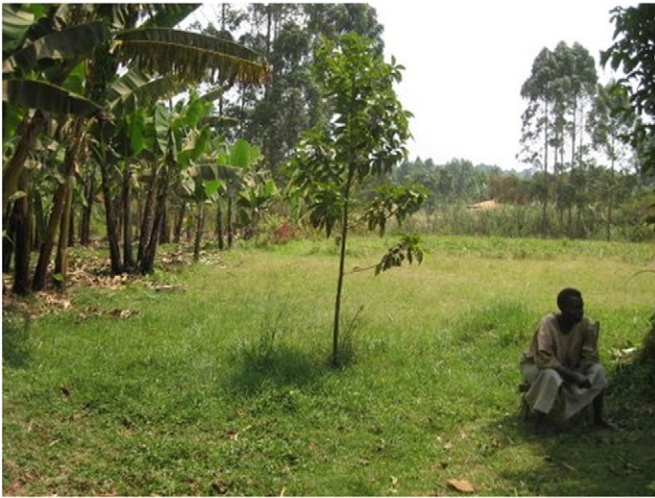
Fig. 2. Papyrus tree.

we get herbal medicines in case you have stomach upsets". In another photo, this same child says: