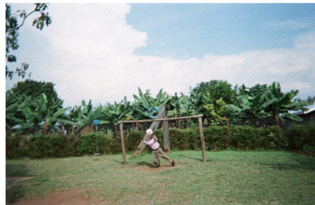
Fig. 5. Photo of playing football.

The children described social issues related to orphan-hood by stating: "HIV positive orphans are being left alone, neglected by rich relatives" and they also experience property grabbing or issues of gaining access to inheritance. One child stated: "those who have taken land from children should give it back because they are the ones making them thieves." Some children spoke fondly of their extended family, while others described being verbally abused and neglected. One child stated: "Whatever they [extended family] do, they remind me of my [deceased] mother. When I have maybe offended one child, they all turn against me. They keep on saying that they will now see where I run to. I used to run to my grandmother, but she also died."