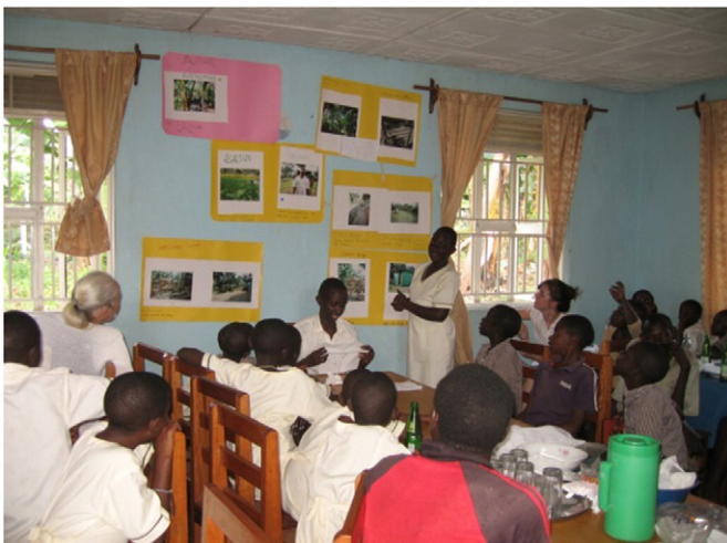
Fig. 1. Photo and story exhibition.

Children had many photos that were snapshots of nature or the natural environment. They described the value of nature, that the natural world is “created by God”, and highlighted how essential these resources are for life and survival. One child described their photo of vegetation (Fig. 2) by saying “These papyrus ... act as a home for aquatic animals and we get fish from here, dig it and grow food and sometimes