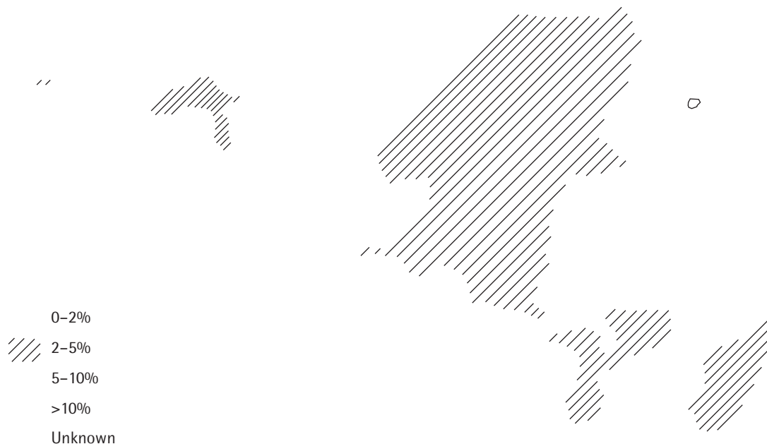
Figure 3. HCV prevalence in Africa by country