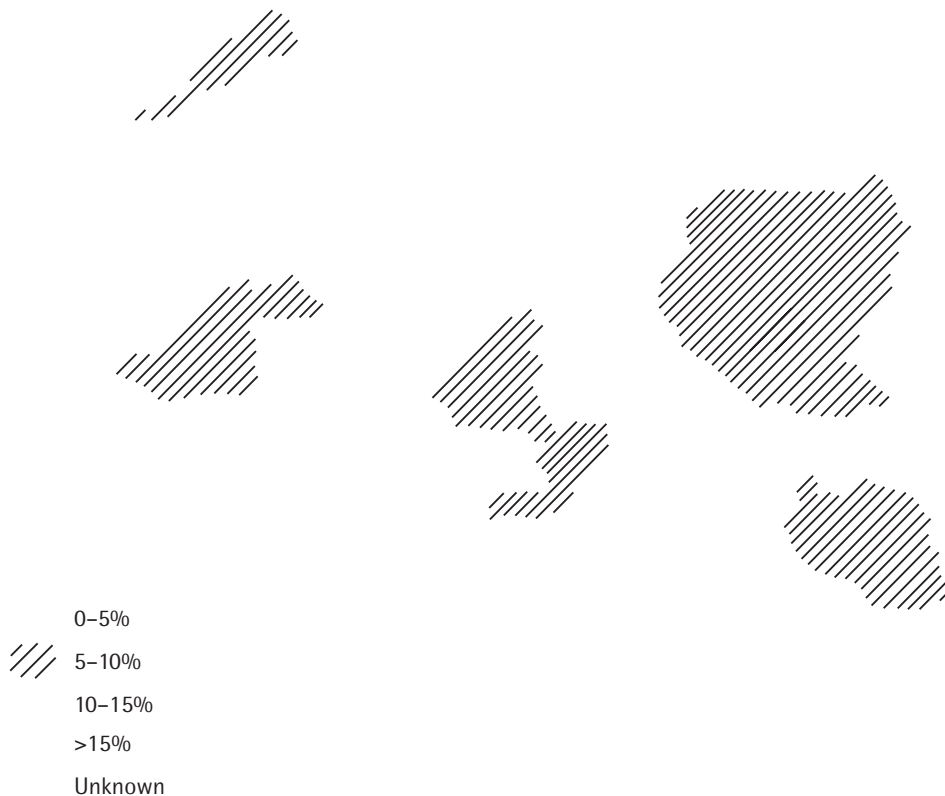
Figure 1. HBV prevalence in Africa by country

Perhaps the most important consideration in HBV/HIV coinfection is treatment with HAART. HBV also has a reverse transcription step in its lifecycle; therefore, some nucleoside/tide analogue reverse transcriptase inhibitors (NRTIs) developed for HIV have proven effective in controlling HBV replication [1]. The majority of clinical experience has been with lamivudine, but so far no data are available from Africa. Successful HBeAg seroconversion occurs in 22–28% of HIV/HBV-coinfected patients at 1 year, similar to that seen in HBV monoinfected patients [20]. The main concern is the development of resistance. Lamivudine resistance develops more rapidly in coinfecting patients, occurring at a rate of 20% per year [21]; this is probably due to higher HBV viral loads in these patients. The emergence of lamivudine resistance is usually clinically detected with a rise in ALT and, although it only very rarely leads to symptomatic hepatitis in the