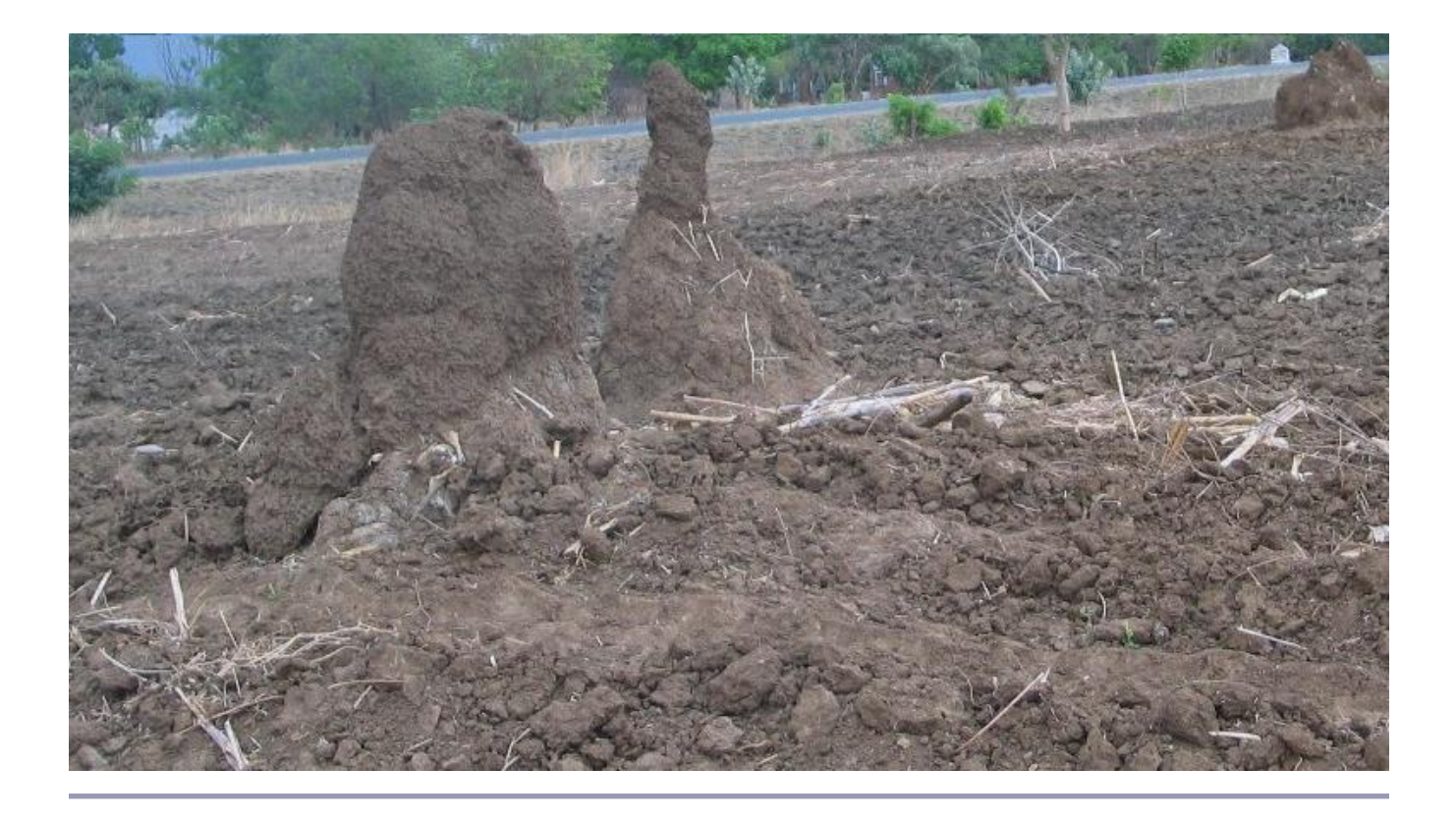
Fig. 3. Farmers' usually leave termitaria intact when cultivating crop fields. This figure shows live Macrotermes mounds left in a field ready for planting maize in Balaka district of southern Malawi.

Sileshi et al. 2005). In Uganda, termite attack was lower in maize–soybean ( Glycine max ) than in maize–groundnut or maize–bean intercrops (Sekamatte et al. 2003). Similarly, in Zambia, some legume trees in agroforestry reduced termite damage to maize more than others (Sileshi et al. 2005). These differences could be attributed to variations in leaf litter, which serves as an alternative source of food for termites and the thick canopy in the intercrops that encouraged predation (Sekamatte et al. 2003, Sileshi et al. 2005).