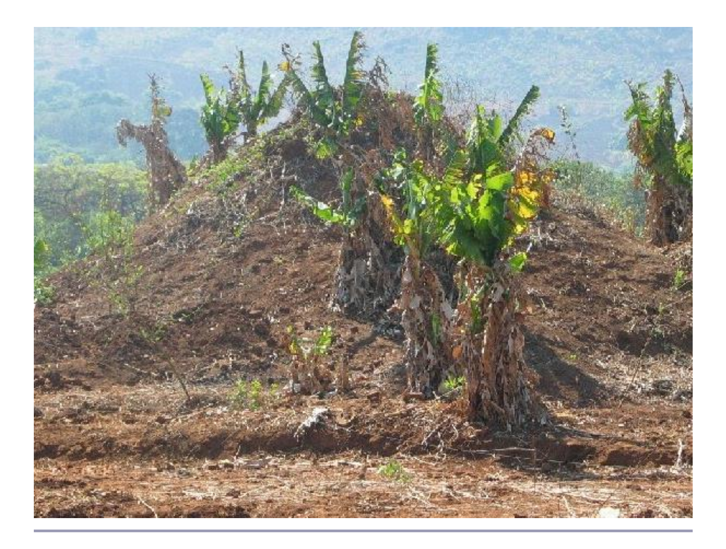
Fig. 2. Farmers' practice of planting crops around termitaria. This farmer in Zomba district of southern Malawi has planted banana and pigeon pea on an Odentotermes mound.