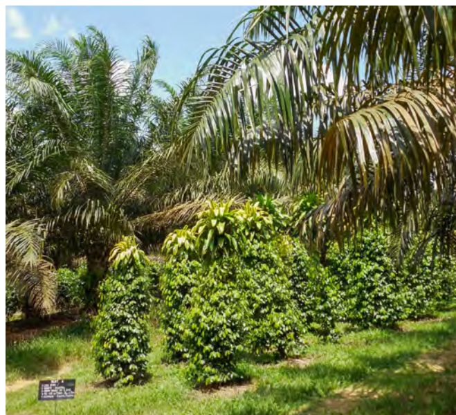
Double row alley intercropping in Malaysia, with cassava (left) and black pepper (right).