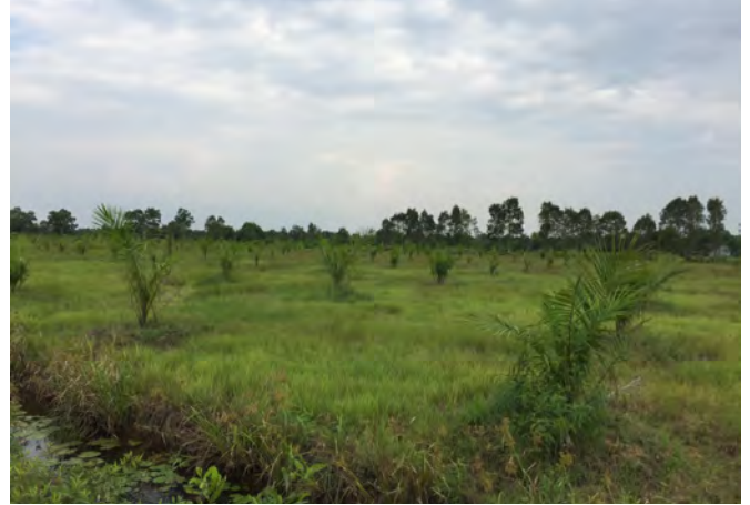
Intercropping in young oil palm plantations in Sumatra, Indonesia. A farmer shows food crops he produces, moving from one young plantation to another (left); and a plantation owned by a large farmer who allows smallholders to grow rice in the first few years after establishment (right).